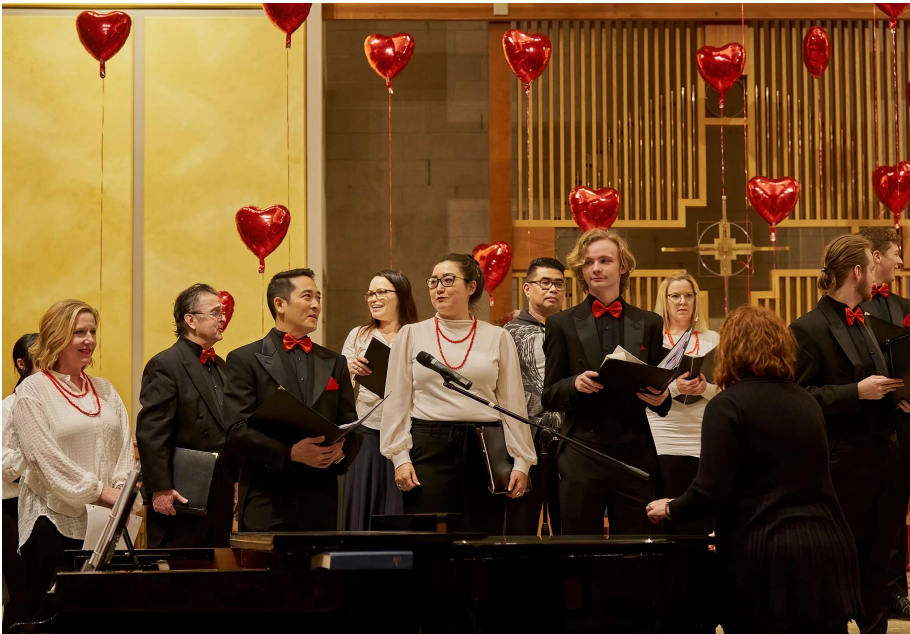
It's always more fun to sing with friends. The Women in Whyte joined the Men in Blaque on Valentine's Day 2023.

Our Winter concert in December featured cherished holiday classics, and a heartwarming community sing-along of beloved carols. We partnered with fifteen women, affectionately known as “Women in Whyte” for our Valentine’s Day concert in February. Finally, we embarked on a global musical journey with our May performance titled “A Choral Passport” featuring a diverse repertoire in Japanese, French, Polish, Latin, German, and English.