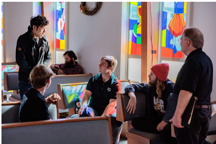
Catching up with old friends.

It wouldn't be a celebration without pizza.